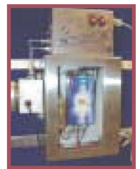
( Fe^{2+} or Fe^{3+} Photo-X UV, Suited for Class 1, Div 1 areas

Continuously monitoring for the precursors ( Fe^{2+} , Fe^{3+} ) to ferric oxide formation ( Fe_2O_3 ) can offer customers a means of detecting the onset of "red water" in pharmaceutical water systems. The spectra below show the relationship between different iron species and wavelength.