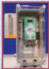
Iron Oxide, Photo-X VIS, Suited for general purpose areas.

Rouge, as generally defined, only refers to ferric oxide ( Fe_2O_3 ), but in reality may contain chromium, nickel, and non-oxide iron compounds, which may result in the broad range of colors observed in the pharmaceutical water. In general, rouge is more prevalent on mechanically polished stainless steel, but has also been observed on electropolished and passivated stainless steel.